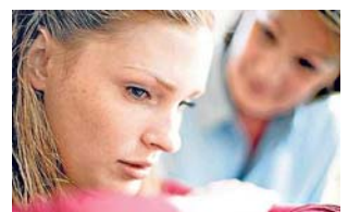
When trying your best never seems to be enough.

You know, "Love your neighbor as you love yourself" implies that you love yourself first. So do you?