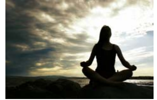
Need to find some peace amid the stresses of life?

group and talk about the other side of this challenge. How do we love one another above all and let go of preconceived expectations? How do we forgive one another for being only human? These questions go both ways. Love one another as God has loved you.