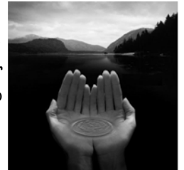
Holding Them Close Yet Letting Them Ripple

have been many more whom I wished knew that they could. Over and over again, I have been able to say to parents that their child is wonderful, that they will be ok, and that, most of all, they need to feel loved and respected.