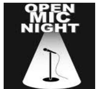
What do you want to share? What song, story, or poem do you have that needs to be heard?