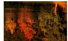
Making it Ripple all fall!